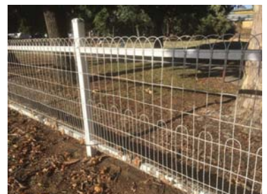
Replace perimeter fence with new emu wire fence