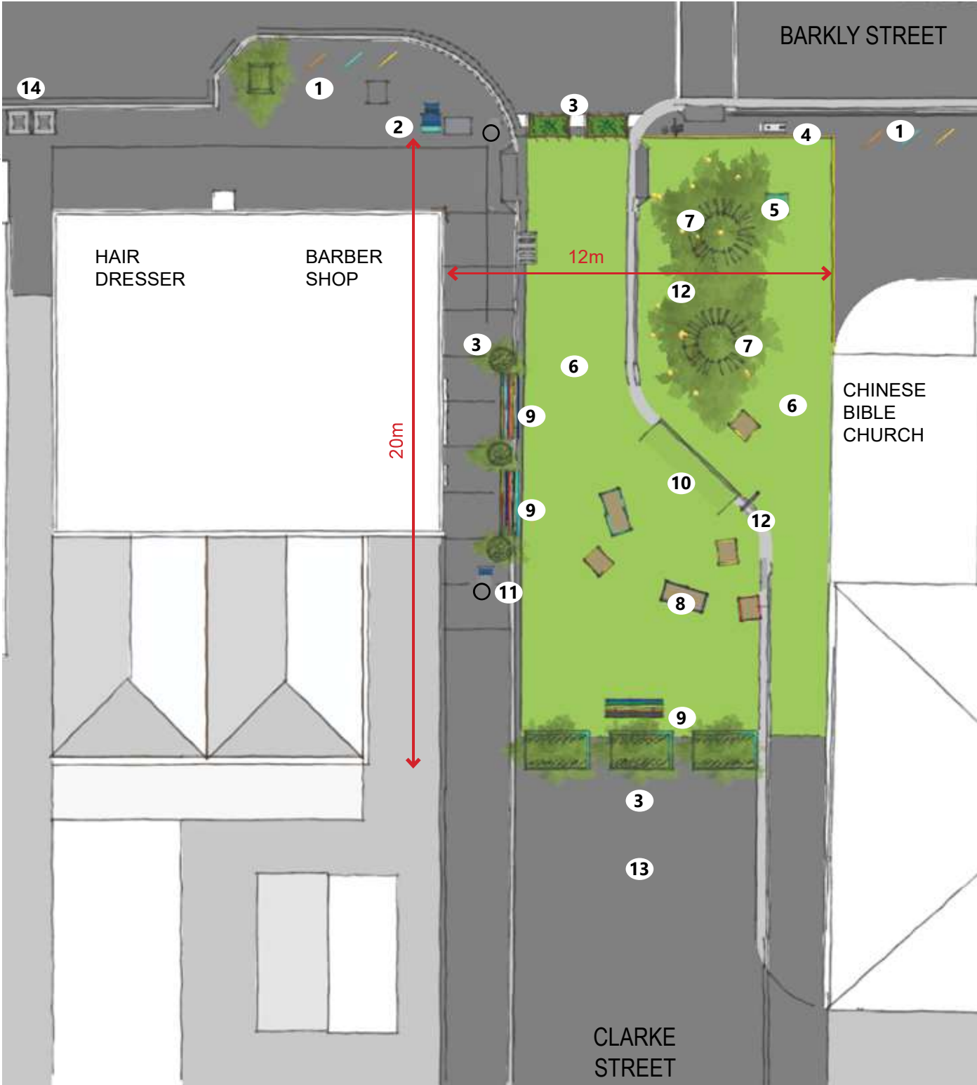
PROPOSED POP UP

Two parking spaces will be removed to install the trial pop up park