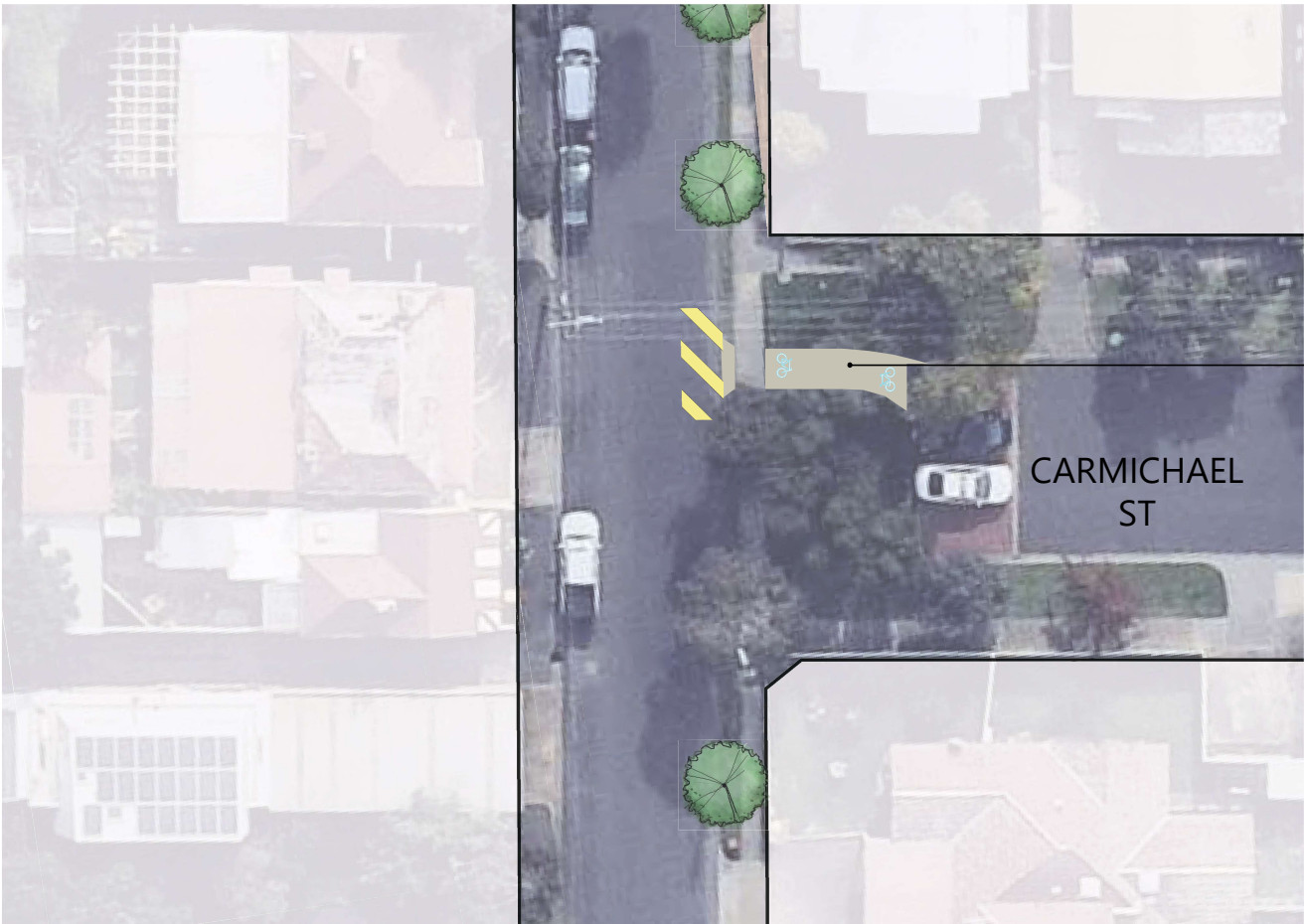
Plan of Bicycle and Pedestrian Improvements at Clarke St and Carmichael St