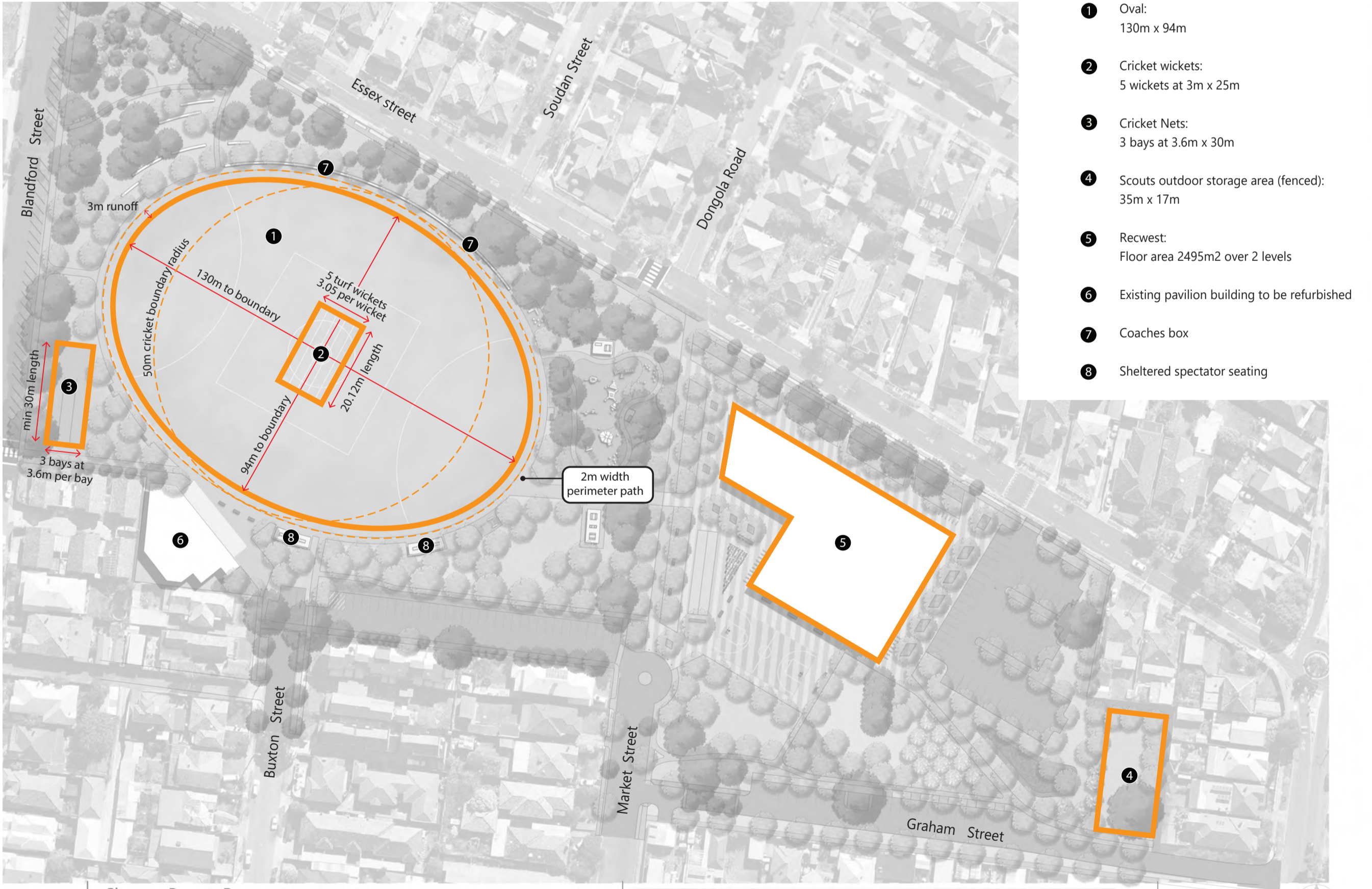
Formal Recreation Facilities