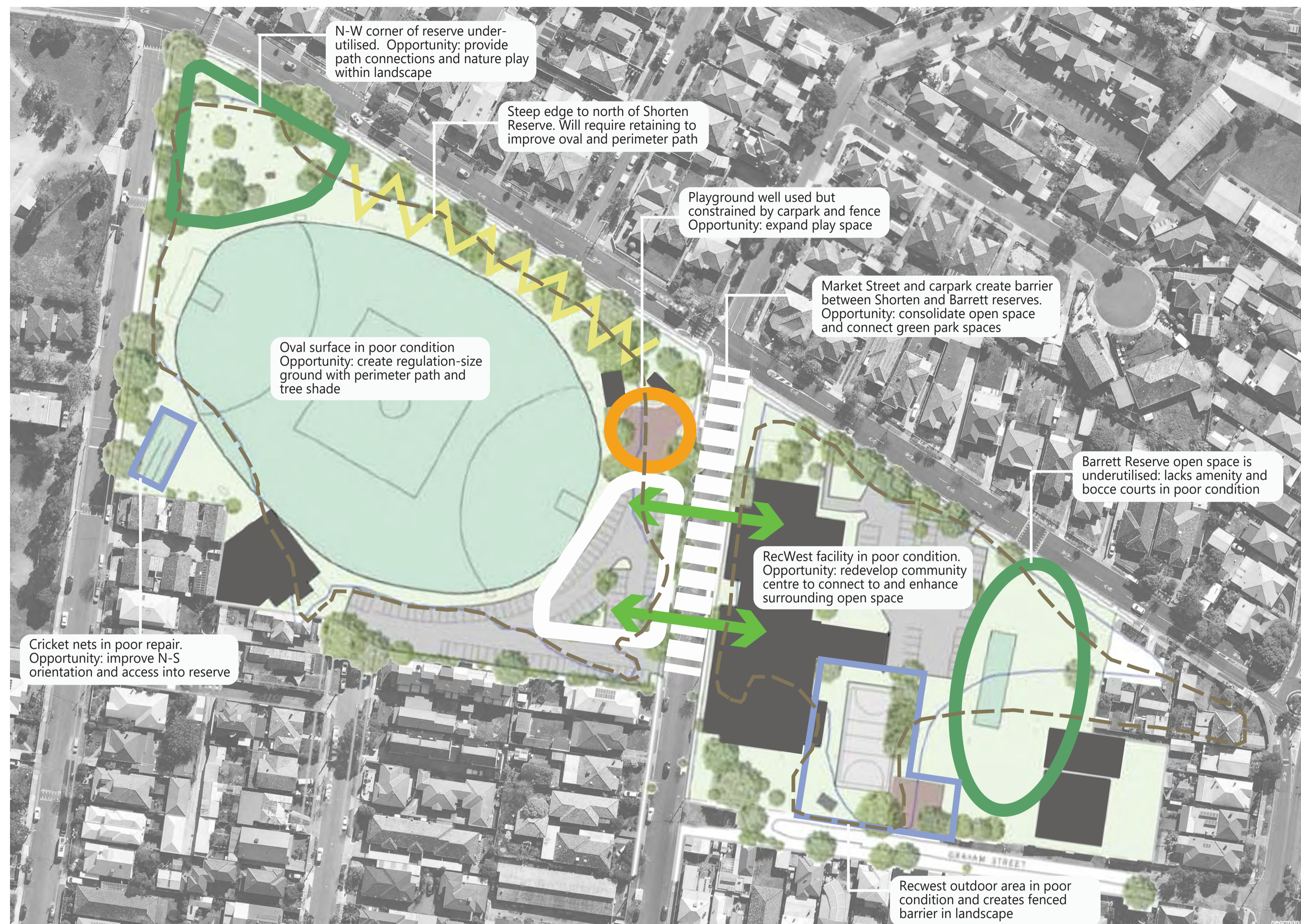
Site Analysis Plan