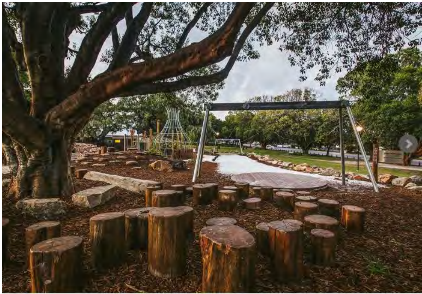
Nature play element among existing trees