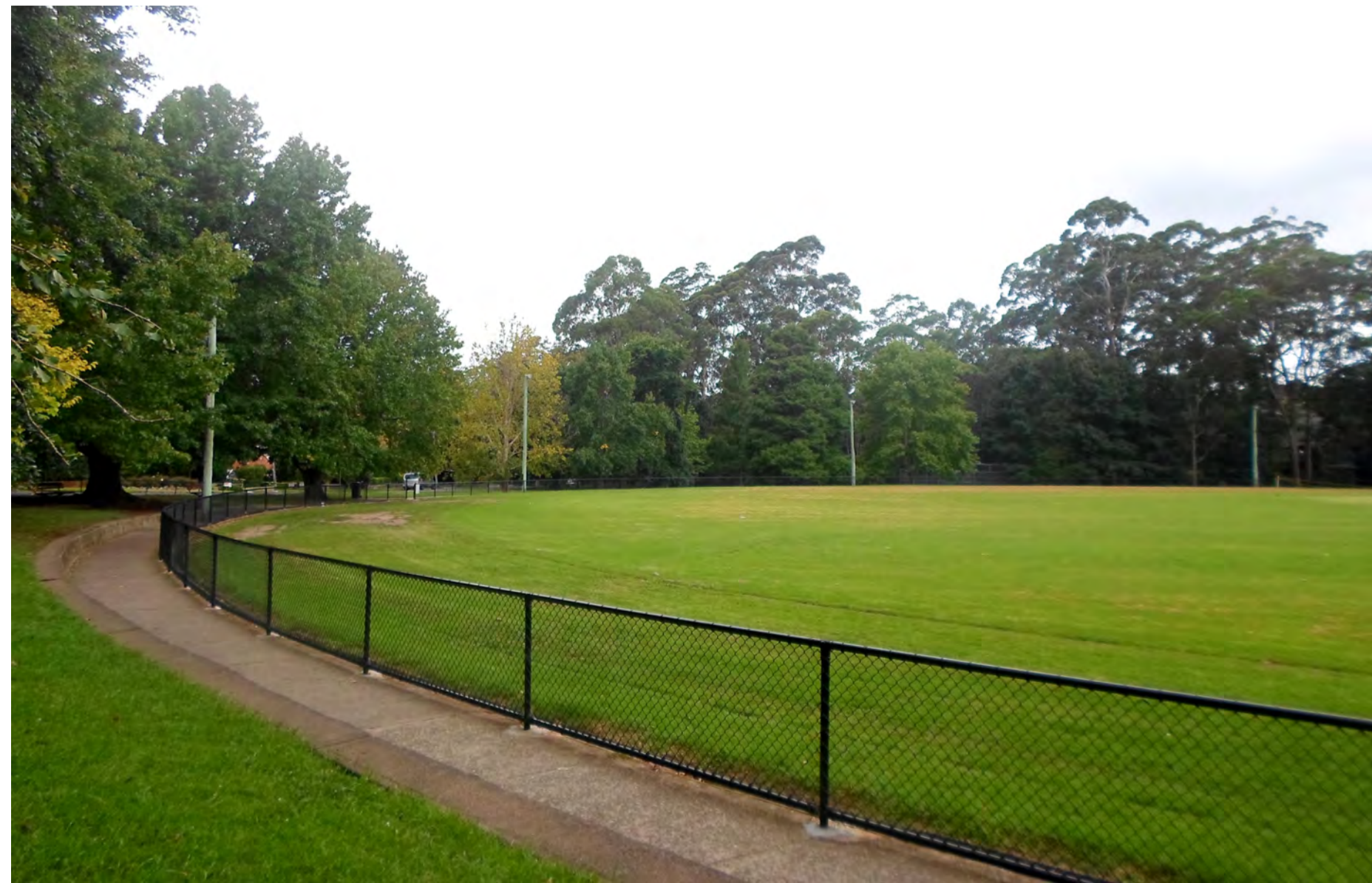
Oval perimeter path and seat wall