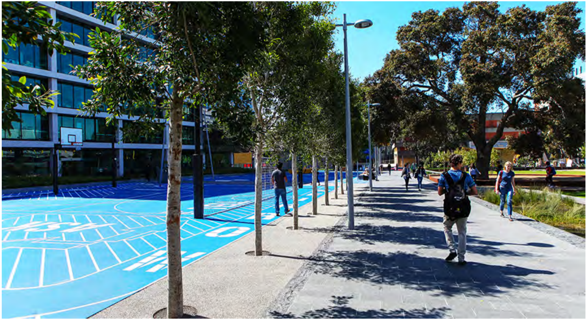
Tree-lined paths and linking spaces