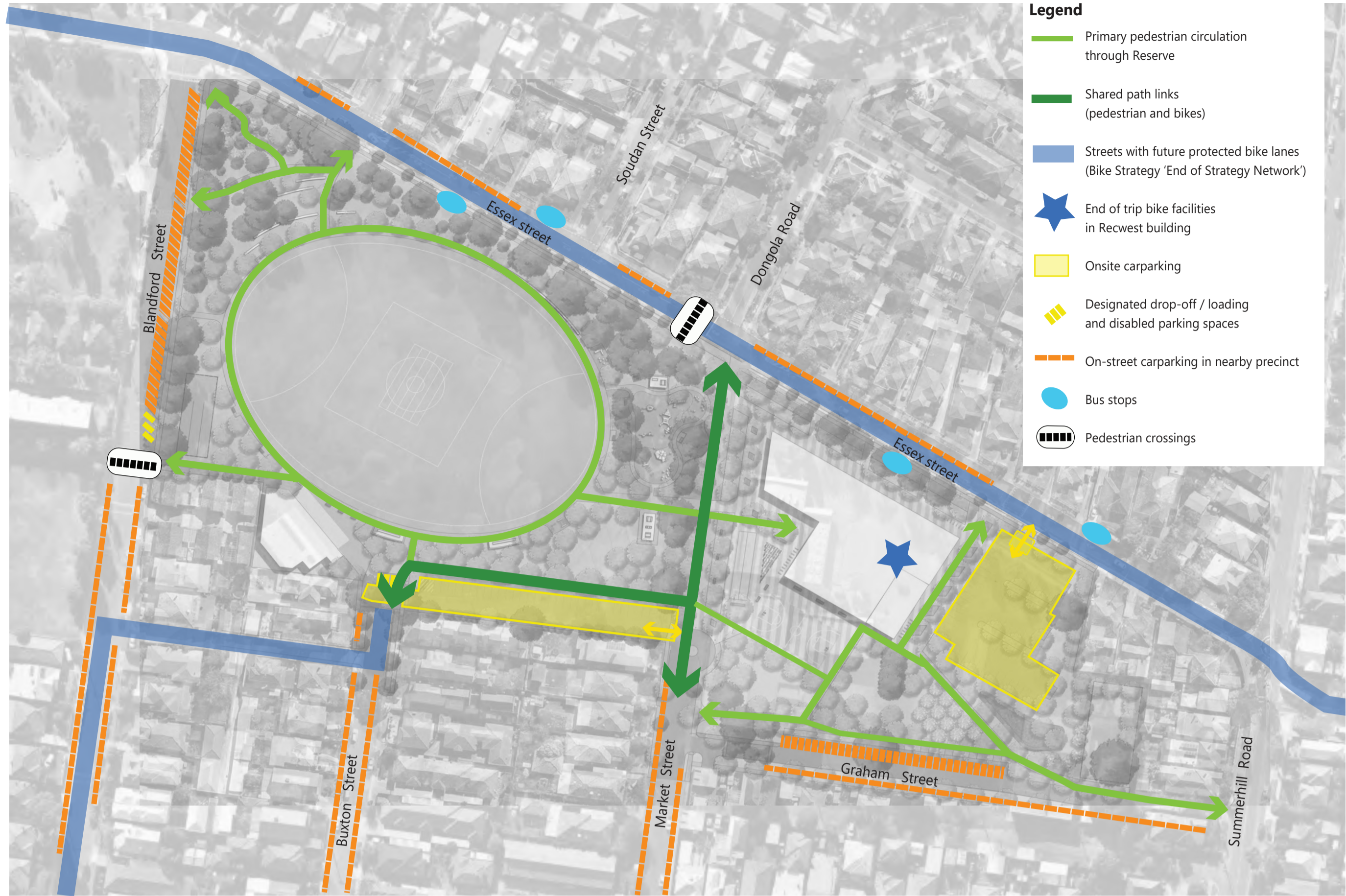
Movement and Transport