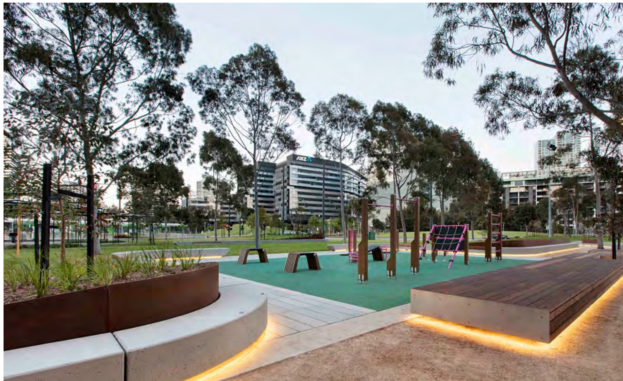
Exercise equipment and seating edges