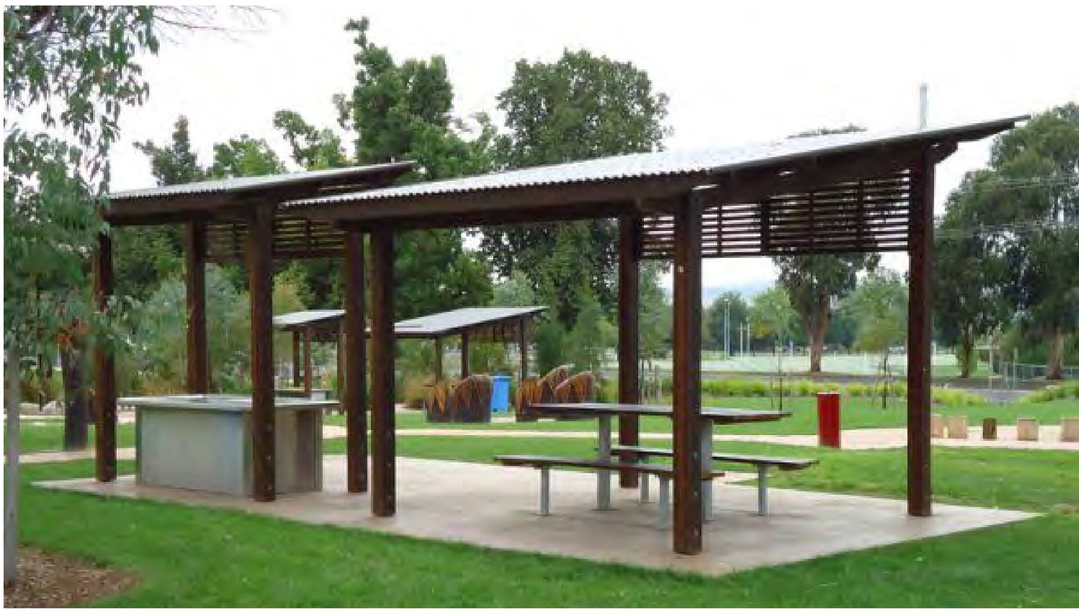
Picnic and barbecue shelters