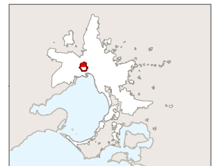
Part of Planning Scheme Map 4