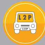
L2P Learner Driver Mentor Program