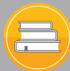
Home Library Service