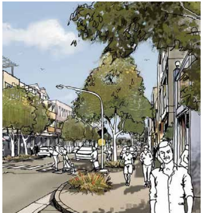
Artist impression of future Barkly Street streetscape from West Footscray Neighbourhood Plan 2018

The closing date for submissions is Monday 14 December 2020.